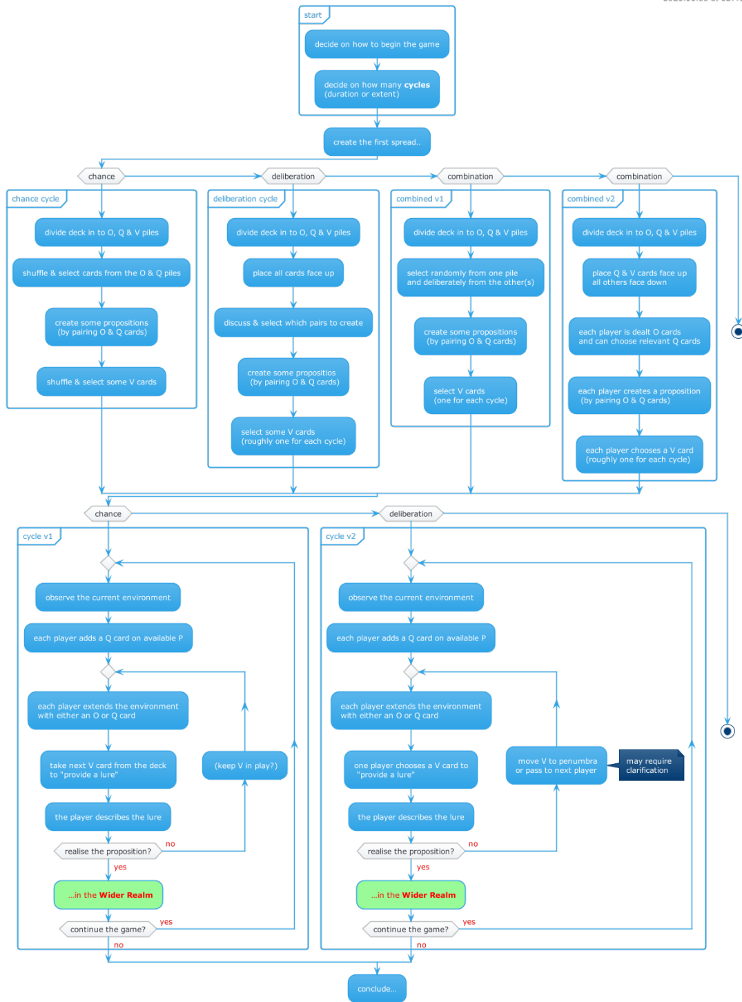
Figure 3: parallel possible flows in detail